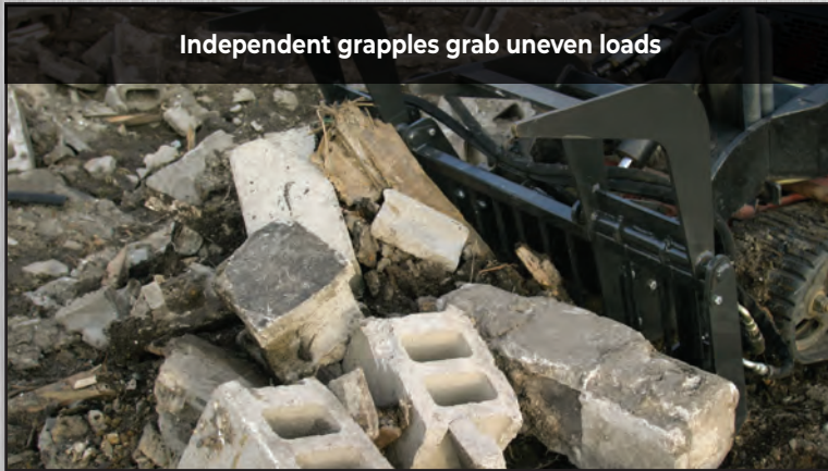
Independent grapples grab uneven loads

The Mini Grapple Rod Bucket is the perfect piece of equipment to dig or root out and grab difficult material, while sifting out unwanted debris. Features two heavy-duty independent grapples powered by 3,000 psi hydraulic cylinders.