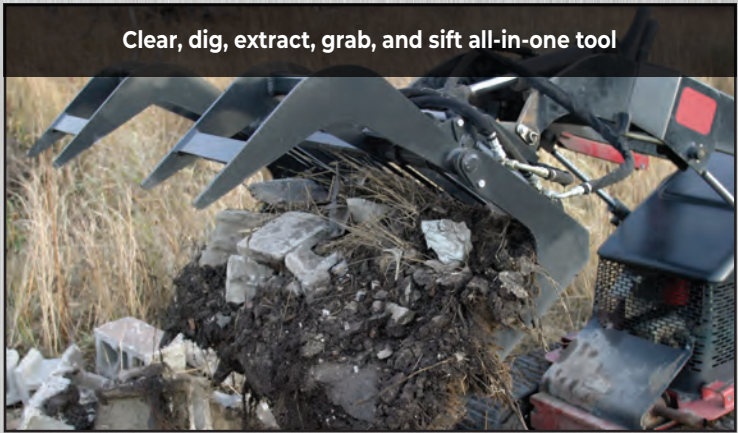
Clear, dig, extract, grab, and sift all-in-one tool