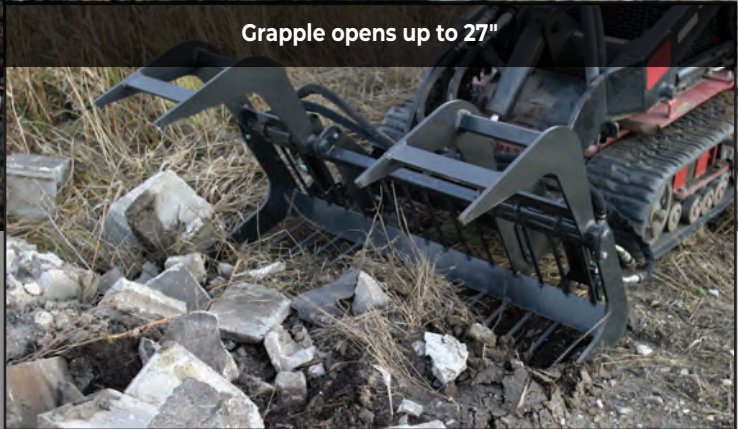
Grapple opens up to 27"

The Mini Grapple Rod Bucket is the perfect piece of equipment to dig or root out and grab difficult material, while sifting out unwanted debris. Features two heavy-duty independent grapples powered by 3,000 psi hydraulic cylinders.