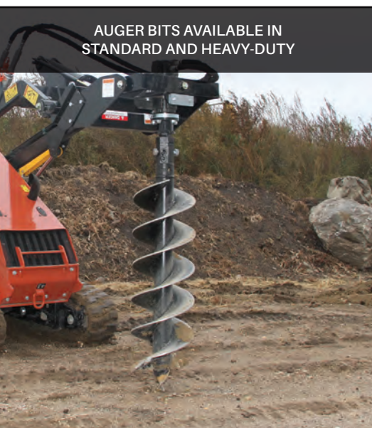
AUGER BITS AVAILABLE IN STANDARD AND HEAVY-DUTY

The powerful Mini Earth Auger units are durable enough to withstand any construction or utility use in even the toughest ground conditions. Available in direct-drive or planetary drive options that offer reverse rotation for cleaning of the hole.