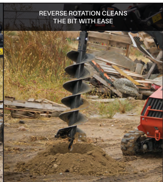
REVERSE ROTATION CLEANS THE BIT WITH EASE